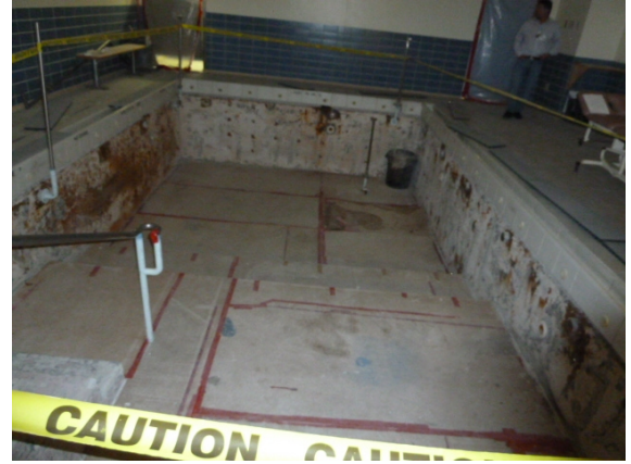
(1988) Hospital Building (Main Floor - Physiotherapy - Pool Room 1148) - wall tiles are delaminating.